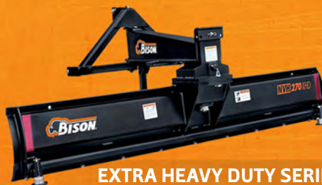
EXTRA HEAVY DUTY SERIES