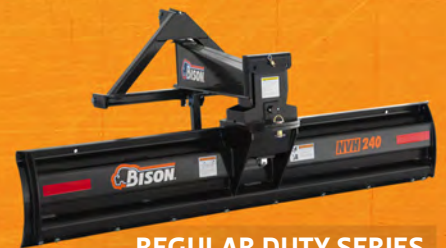
REGULAR DUTY SERIES