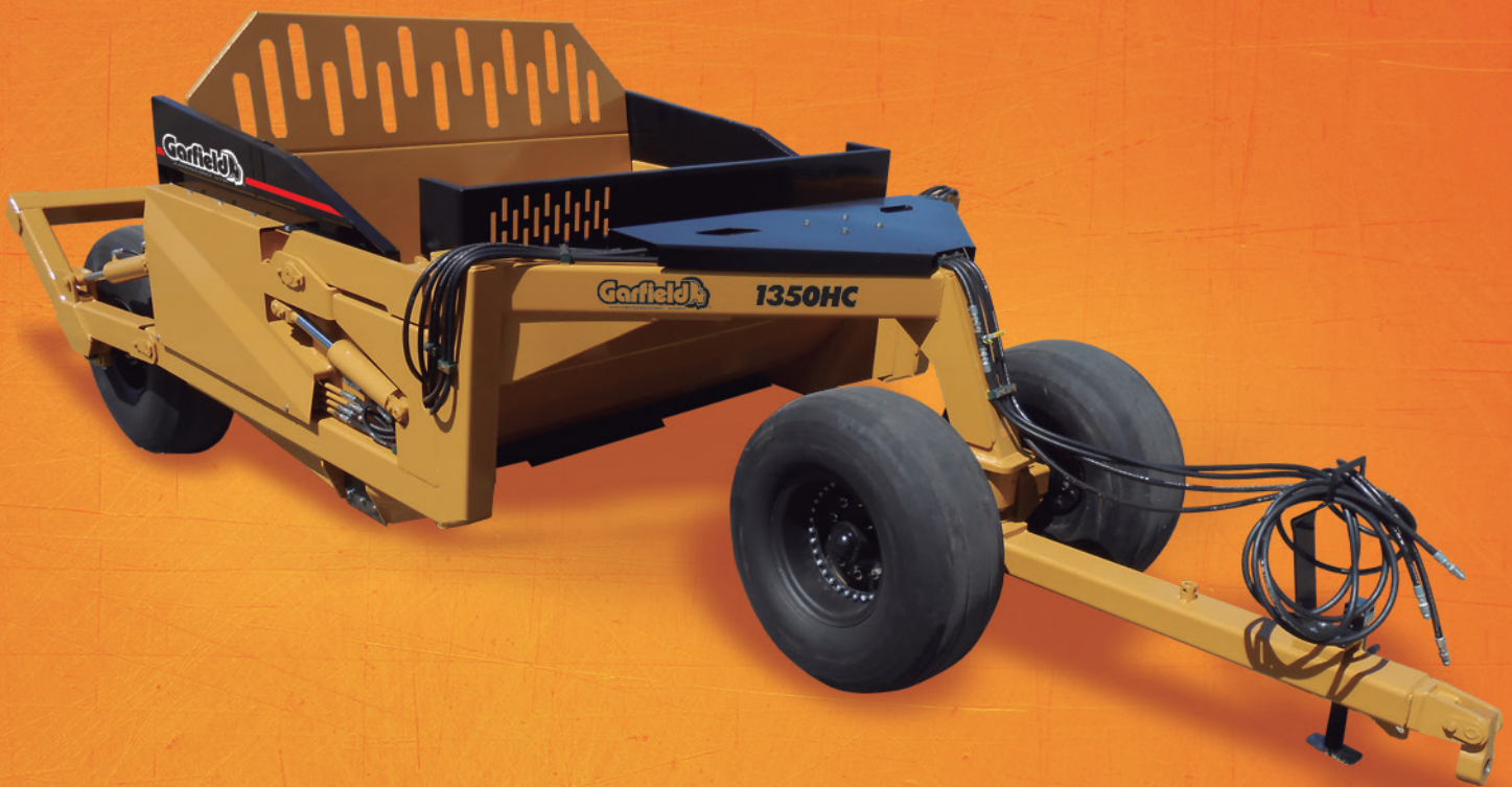
MODEL 1350HC CARRY-ALL EJECTION SCRAPER