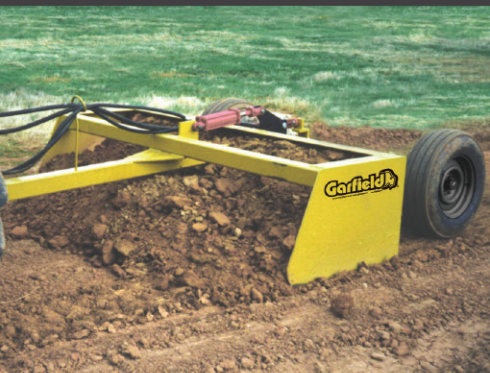
Large capacity box.