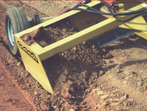
Reversible cutting edges.