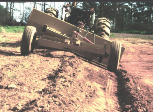
Tilt and ripper options available.